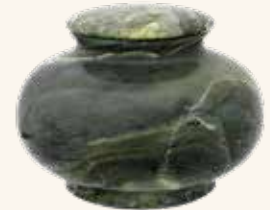
Glade Mist Marble (8-632)