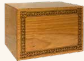
Alder Wood* (8-338)