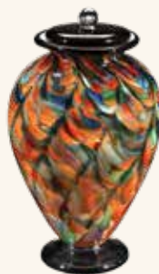
Flared Classic Rainbow Glass (8-714)