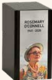
Versatile Custom Photo Designs (8-418)