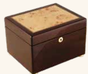
Reflections II Maple Inlay* (8-576)