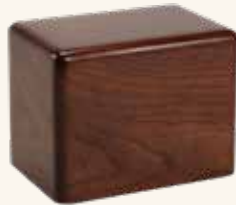
Solid Cherry Wood* (8-140)