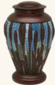
Mosaic Wheat (8-572)