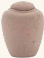
Sand Urn (8-446)