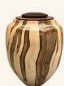
Ambrosia Maple Wood* (8-439)