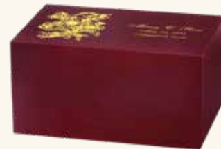
Regal Painted Bronze (8-349 GRN, BL, M)

Includes name, dates, endearment, and one standard design. Choice of green, blue, or merlot