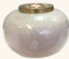
White Candle (8-710)