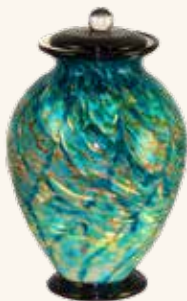
Flared Classic Aegean Glass (8-320)