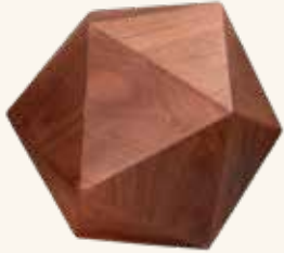
Barnes Wood* (8-109)

Forest Lawn's Rules and Regulations place some restrictions on the type of containers or urns which can be interred in Forest Lawn or in which Forest Lawn will place remains. The following urns and containers are available for all closed front niches, size permitting, or ground burial. Approximate sizes listed by height, width and depth.