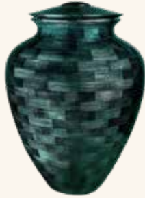
Ocean Tranquility* (8-460)

Forest Lawn's Rules and Regulations place some restrictions on the type of containers or urns which can be interred in Forest Lawn or in which Forest Lawn will place remains. The following urns and containers are available for all closed front niches, size permitting, or ground burial. Approximate sizes listed by height, width and depth.