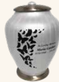
White Pearl (8-570BF, TR) Includes name, dates and endearment Choice of Butterfly or Tree of Life Design