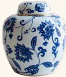
Prince Blue Montreal (8-723)

Forest Lawn's Rules and Regulations place some restrictions on the type of containers or urns which can be interred in Forest Lawn or in which Forest Lawn will place remains. The following urns and containers are available for all closed front niches, size permitting, or ground burial. Approximate sizes listed by height, width and depth.