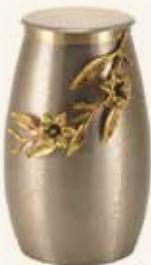
Windsong Lily Pewter (8-441)