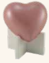
Pink Heart (8-144P)

Includes name, dates, and endearment Stand included