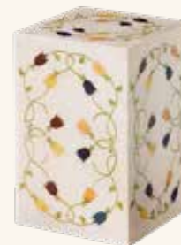
Alexandra Vertical Flower Inlay* (8-116V)