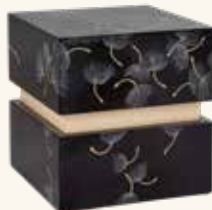
Dandelion Wood* (8-385)