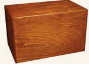
Regency Wood* (8-716)