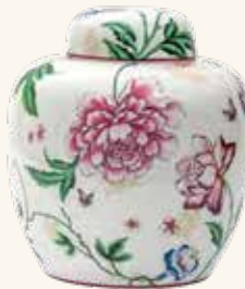
Peonies Montreal (8-730)