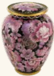
Floral Blush Cloisonné (8-325)