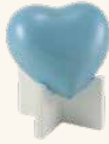
Blue Heart (8-144B)

Includes name, dates, and endearment Stand included