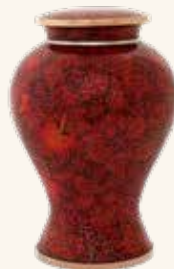
Autumn Leaves Cloisonné (8-648)