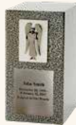
Gray Angel (8-380) Includes nameplate with names, dates and endearment