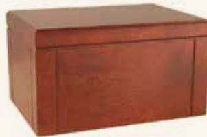
Hartley Wood* (8-568)