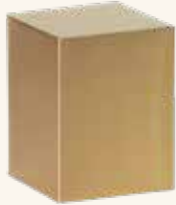
The Copper Box (8-001)

Forest Lawn's Rules and Regulations place some restrictions on the type of containers or urns which can be interred in Forest Lawn or in which Forest Lawn will place remains. The following urns and containers are available for all closed front niches, size permitting, or ground burial. Approximate sizes listed by height, width and depth.