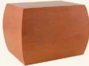
Honey Brown Cube* (8-562)