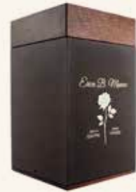
The Langley in Black Walnut (8-728) Includes names, dates and endearment