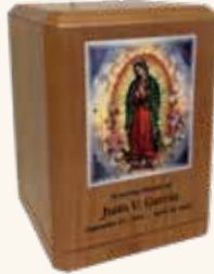
Our Lady of Guadalupe Maple* (8-476) Includes name, dates, and endearment