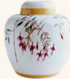
Garden Montreal (8-724)