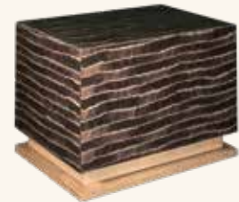
Moonlight Wood* (8-652M)