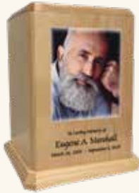
Custom Wood Photo Image* (8-588) Includes photograph, name, dates, and endearment

Forest Lawn's Rules and Regulations place some restrictions on the type of containers or urns which can be interred in Forest Lawn or in which Forest Lawn will place remains. The following urns and containers are available for all closed front niches, size permitting, or ground burial. Approximate sizes listed by height, width and depth.