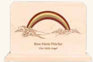
The Rainbow Wood* (8-135)