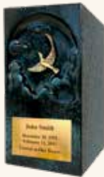
Sky Blue Dove (8-330) Includes nameplate with names, dates and endearment