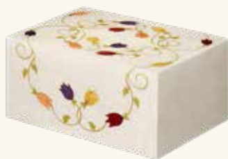
Alexandra Horizontal Flower Inlay* (8-116H)