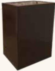
Plastic Urn with Wrap (8-644)

Forest Lawn's Rules and Regulations place some restrictions on the type of containers or urns which can be interred in Forest Lawn or in which Forest Lawn will place remains. The following urns and containers are available for all closed front niches, size permitting, or ground burial. Approximate sizes listed by height, width and depth.