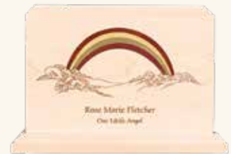
The Rainbow Wood* (8-135)