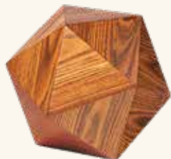
Barnes Wood* (8-109) 9 x 9 1/2" x 8 1/2" $1,095