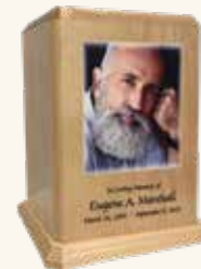
Custom Wood Photo Image* (8-588) Includes photograph, name, dates, and endearment 9 1/2" x 7 1/2" x 7 1/2" $595 E