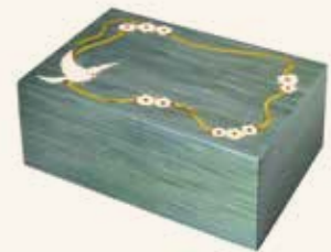
Lucinda Dove (8-436) Includes name and dates 4 1/2" x 10 5/8" x 7 1/8" $995 E