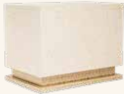
Grace* (8-652G) 8 2/5" x 10 3/4" x 7 1/5" $895

Forest Lawn's Rules and Regulations place some restrictions on the type of containers or urns which can be interred in Forest Lawn or in which Forest Lawn will place remains. The following urns and containers are available for all closed front niches, size permitting, or ground burial. Approximate sizes listed by height, width and depth.