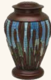
Mosaic Wheat (8-572) 11 7/10" x 7 1/4" $495