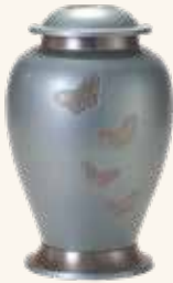
Avondale Teal with Butterflies (8-620) 10 1/2" x 6 3/4" $495

Forest Lawn's Rules and Regulations place some restrictions on the type of containers or urns which can be interred in Forest Lawn or in which Forest Lawn will place remains. The following urns and containers are available for all closed front niches, size permitting, or ground burial. Approximate sizes listed by height, width and depth.