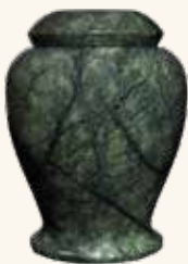
Jade (8-636) 10 3/4" x 8" $695