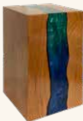
Still Water* (8-470) 10" x 5 3/4" x 5 3/4" $595