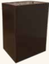
Plastic Urn with Wrap (8-644)

Forest Lawn's Rules and Regulations place some restrictions on the type of containers or urns which can be interred in Forest Lawn or in which Forest Lawn will place remains. The following urns and containers are available for all closed front niches, size permitting, or ground burial. Approximate sizes listed by height, width and depth.