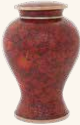
Autumn Leaves Cloisonné (8-648) 11" x 7" $595

Forest Lawn's Rules and Regulations place some restrictions on the type of containers or urns which can be interred in Forest Lawn or in which Forest Lawn will place remains. The following urns and containers are available for all closed front niches, size permitting, or ground burial. Approximate sizes listed by height, width and depth.