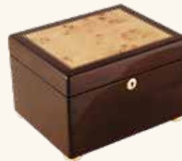
Reflections II Maple Inlay* (8-576) Includes sheet metal urn 6 1/2" x 10 1/4" x 8 1/4" $595