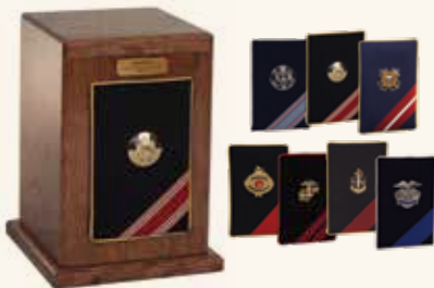
Military Wood* with Military Branch Emblem (8-573AF, AR, CG, FF, MA, NV, PO)

Includes engraving, name, dates, and endearment