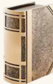
Leatherette Bronze Book (8-377) 10 5/16" x 4 1/8" x 7 1/4" $1,195