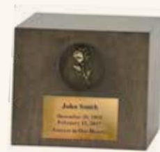
Classic Maple Wood w/ Rose Emblem* (8-215) Includes nameplate with name, dates and endearment 7 1/2" x 8 3/4" x 6 1/2" $595 E

*Due to the natural variations that occur in wood, such as grain, texture and color, the samples and photos do not exactly match the actual wood products.