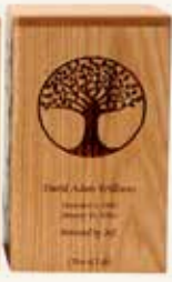
Tree of Life