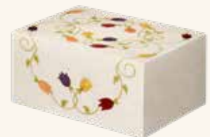
Alexandra Flower Inlay* (8-116) Includes name and dates 4 1/2" x 10 5/8" x 7 1/8" $1,395 E

*Due to the natural variations that occur in wood, such as grain, texture and color, the samples and photos do not exactly match the actual wood products.