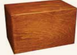
Regency Wood* (8-716)