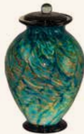
Flared Classic Aegean Glass (8-320) 11 1/2" x 8" $695