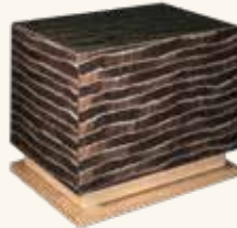
Moonlight Wood* (8-652M) 8 2/5" x 10 3/4" x 7 1/5" $895