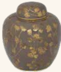
Anthemis Brown Montreal (8-726) with gold leaves detail 9 1/2" x 8 3/4" $995