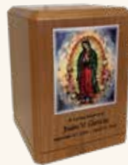
Our Lady of Guadalupe Maple* (8-476) Includes name, dates, and endearment 9 3/8" x 6 3/4" x 6 3/4" $595 E