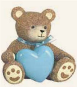
Blue Teddy Bear with Heart (8-109B)