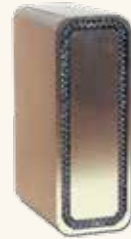
Security (8-222) 9 1/2" x 3 1/2" x 6" $595