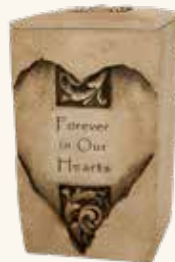
Forever in Our Hearts (8- 640) 11 1/4" x 7" x 6" $495