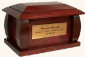
Imperial* (8-718) Includes name, dates, and endearment 7 1/2" x 11 7/8" x 7 7/8" $495 E