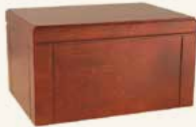
Hartley Wood* (8-568)