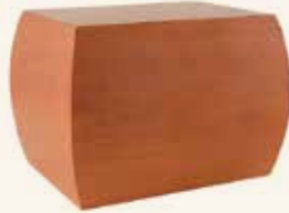
Honey Brown Cube* (8-562)