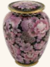
Floral Blush Cloisonné (8-325) 9 1/5" x 6 4/5" $595