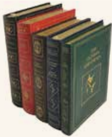
5 Book Library Collection (8-727)