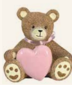
Pink Teddy Bear with Heart (8-109P)