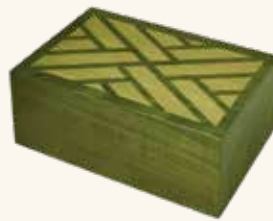
Charlotte Green (8-433) Includes name and dates 4 1/2" x 10 5/8" x 7 1/8" $995 E