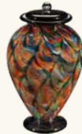
Flared Classic Rainbow Glass (8-714) 11 1/2" x 8" $695

*Due to the natural variations that occur in wood, such as grain, texture and color, the samples and photos do not exactly match the actual wood products.