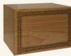
Alder Wood* (8-338)