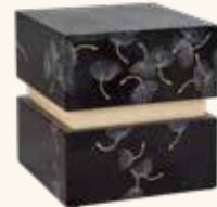
Dandelion Wood* (8-385) 8 1/2" x 8 3/16" x 8 3/16" $995