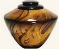
Brown Swirl (8-653)