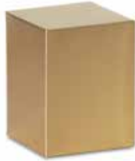
THE COPPER BOX (8-001) 4" x 3" x 3" $50

Forest Lawn's Rules and Regulations place some restrictions on the type of containers or urns which can be interred in Forest Lawn or in which Forest Lawn will place remains. The following urns and containers are available for all closed front niches, size permitting, or ground burial. These urns are also available for our Cremation Packages. Approximate sizes listed by height, width and depth.