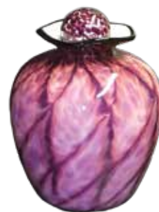
BELLA MAUVE GLASS (8-708)