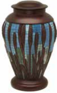
MOSAIC WHEAT (8-572) 11 7/10" x 7 1/4" $450