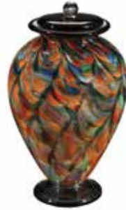
FLARED CLASSIC RAINBOW GLASS (8-714)