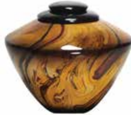
BROWN SWIRL (8-653)