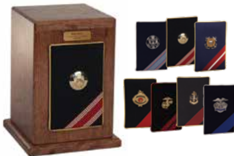
MILITARY WOOD* WITH MILITARY BRANCH EMBLEM (8-573AF, AR, CG, FF, MA, NV, PO)

Includes engraving, name, dates, and endearment