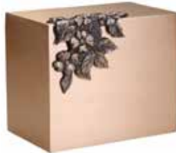
DOGWOOD COMPANION (8-633)

Includes engraving, name, dates, and endearment 9 7/8" x 9 7/8" x 7 1/2" $795 E