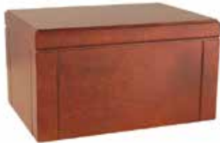
HARTLEY WOOD* (8-568)