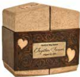
EVERAFTER COMPANION (8-429)

Includes engraving, name, dates, and endearment 9 7/8" x 9 7/8" x 7 1/2" $795 E