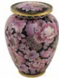
FLORAL BLUSH CLOISONNÉ (8-325) 9 1/5" x 6 4/5" $495