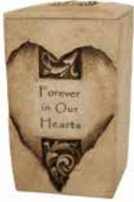
FOREVER IN OUR HEARTS (8-640)