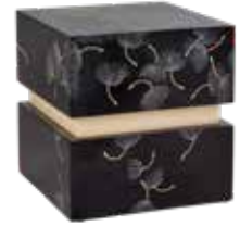
DANDELION WOOD* (8-385)