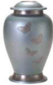
AVONDALE TEAL WITH BUTTERFLIES (8-620) 10 1/2" x 6 3/4" $450