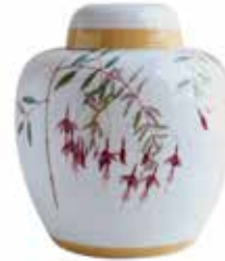
GARDEN MONTREAL (8-724)