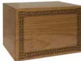
ALDER WOOD* (8-338)