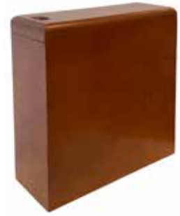
SCATTERING URN* (8-634)