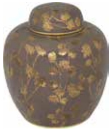
ANTHEMIS BROWN MONTREAL (8-726)