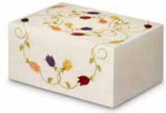
ALEXANDRA FLOWER INLAY* (8-116)

Includes name and dates 4 1/2" x 10 5/8" x 7 1/8" $1,295 E