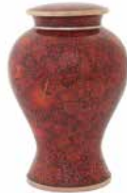
AUTUMN LEAVES CLOISONNÉ (8-648) 11" x 7" $495