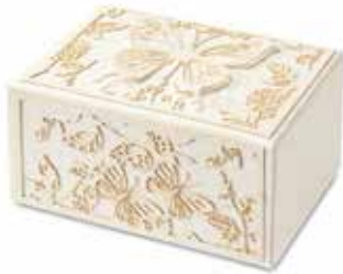
BUTTERFLY REFLECTIONS (8-003)