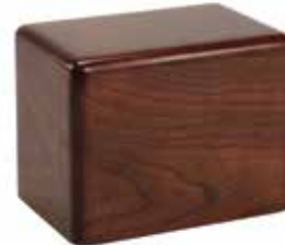
SOLID CHERRY WOOD* (8-140) 4 1/2" x 6" x 4" $50