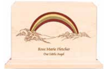
THE RAINBOW WOOD* (8-135) Includes name, dates, and endearment 5 9/10" x 8 2/5" x 6 1/2" $215

*Due to the natural variations that occur in wood, such as grain, texture and color, the samples and photos do not exactly match the actual wood products.