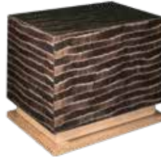
MOONLIGHT WOOD* (8-652M)