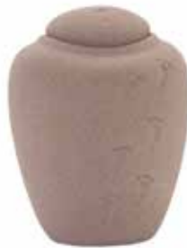
FOOTPRINTS IN THE SAND (8-645)