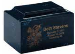
CULTURED MARBLE (8-649 GRN, WHT, GRY, NVY)

Includes name, dates, endearment, and one standard design. Choice of green, white, gray or navy