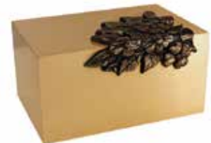
DOGWOOD BRONZE CHEST (8-574)

Includes sheet metal urn 6 1/2" x 10 1/4" x 8 1/4" $595