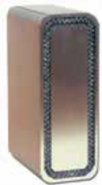
SECURITY (8-222) 9 1/2" x 3 1/2" x 6" $495