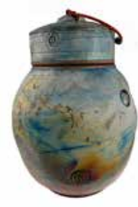
RAKU POTTERY (8-455)