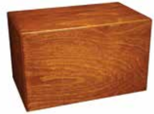
REGENCY WOOD* (8-716)