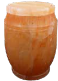
SALT BIODEGRADABLE URN (8-758)

Color varies – One-of-a-kind 10 1/4" x 8" $395