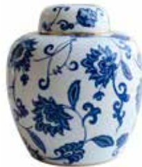
PRINCE BLUE MONTREAL (8-723)