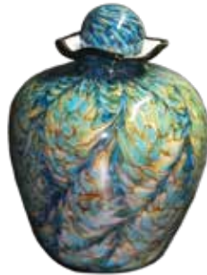
BELLA TEAL GLASS (8-707)