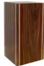
LAUREL WOOD* (8-374) 9 3/4" x 5 1/2" x 5 1/2" $495

*Due to the natural variations that occur in wood, such as grain, texture and color, the samples and photos do not exactly match the actual wood products.