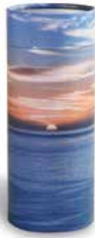
OCEAN SUNSET (8-635 OCEAN)