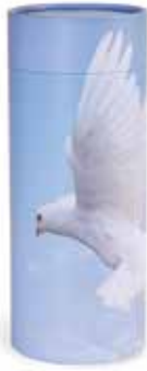
ASCENDING DOVE (8-635 DOVE)

Forest Lawn's Rules and Regulations place some restrictions on the type of containers or urns which can be interred in Forest Lawn or in which Forest Lawn will place remains. The following urns and tubes cannot be interred in the park, with the exception of the Scattering Urn. These urns are also available for our Cremation Packages. Approximate sizes listed by height, width and depth.