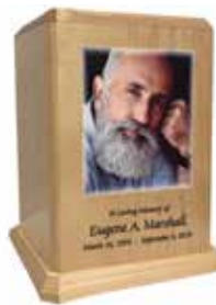
CUSTOM WOOD PHOTO IMAGE* (8-588)

Includes engraving, name, dates, and endearment 9 7/8" x 7 3/4" x 7 3/4" $495 E