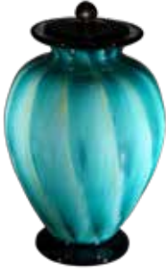
FLARED CLASSIC AQUA GLASS (8-658)