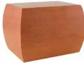
HONEY BROWN CUBE* (8-562)