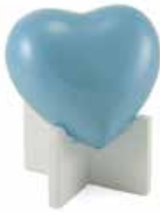
BLUE HEART (8-144B) Includes name, dates, and endearment Stand included 4 1/5" x 4 1/2" x 2 1/2" $120