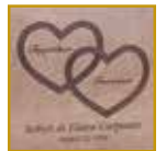
CUSTOM WOOD "TOGETHER FOREVER" COMPANION* (8-618)

Includes choice of standard design or laser etched photograph, name, dates, and endearment 7 3/4" x 10 1/4" x 11 1/2" $795 E