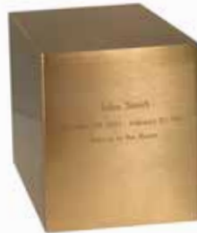
CLASSIC BRONZE (8-362)