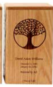
Tree of Life