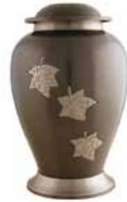
AVONDALE SLATE WITH LEAVES (8-590) 10 1/2" x 6 3/4" $450