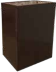
PLASTIC URN WITH WRAP (8-644)