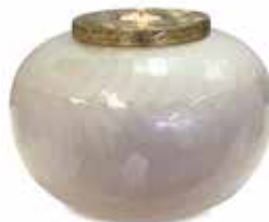
WHITE CANDLE (8-710)