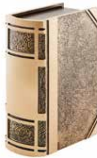
LEATHERETTE BRONZE BOOK (8-377)