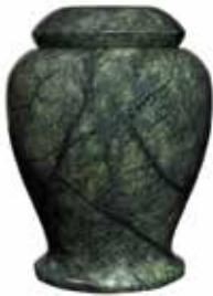
JADE (8-636) 10 3/4" x 8" $495