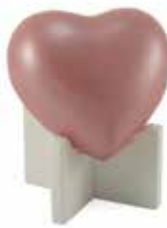
PINK HEART (8-144P) Includes name, dates, and endearment Stand included 4 1/5" x 4 1/2" x 2 1/2" $120