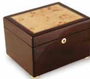
REFLECTIONS II MAPLE INLAY* (8-576)

Includes sheet metal urn 6 1/2" x 10 1/4" x 8 1/4" $595