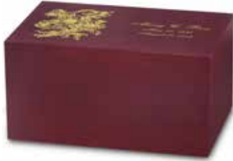
REGAL PAINTED BRONZE (8-349 GRN, BL, M)

Includes name, dates, endearment, and one standard design. Choice of green, blue, or merlot