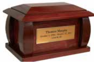
IMPERIAL* (8-718) Includes name, dates, and endearment 7 1/2" x 11 7/8" x 7 7/8" $495 E