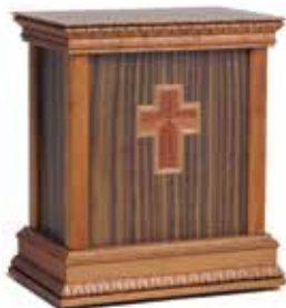
CLASSIC CROSS WOOD* (8-614)