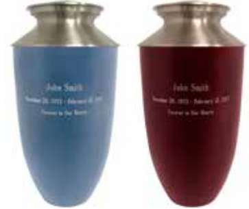
THE NOBLE (8-423 BL, R)

Includes name, dates, and endearment. Choice of blue or red.