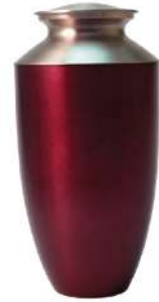
THE RUBY (8-423) 11 9/10" x 6" $395