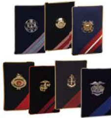
MILITARY WOOD WITH MILITARY BRANCH EMBLEM (8-573AF, AR, CG, FF, MA, NV, PO) Includes engraving, name, dates, and endearment 10 1/2" x 8" x 8" $395 E