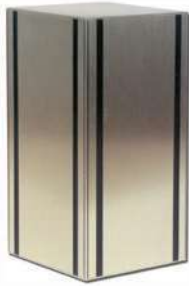
DEVOTION (8-106) 9 1/2" x 5" x 5" $395

Forest Lawn's Rules and Regulations place some restrictions on the type of containers or urns which can be interred in Forest Lawn or in which Forest Lawn will place remains. The following urns and containers are available for all closed front niches, size permitting, or ground burial. Approximate sizes listed by height, width and depth.