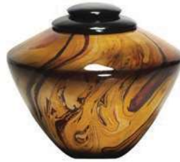
BROWN SWIRL (8-653) 8" x 9" $395