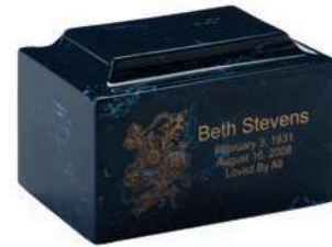
CULTURED MARBLE (8-649 GRN, WHT, GRY, NVY) Includes name, dates, endearment, and one standard design. Choice of green, white, gray or navy 6 2/5" x 9 7/10" x 6 3/4" $395 E